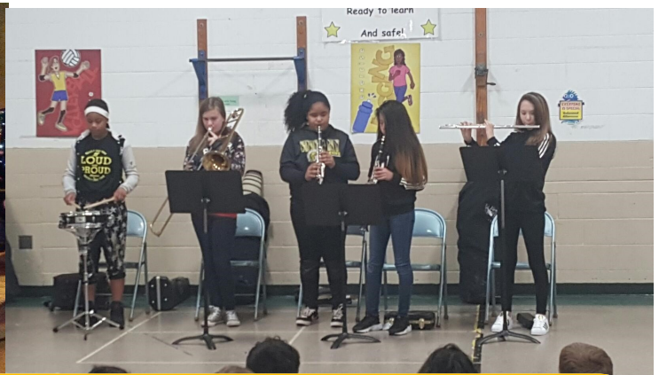
Top photos: Waverly Marching Band in the Silver Bells Parade & Waverly East Band Students