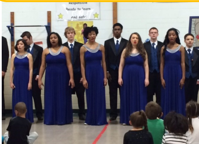
Bottom photos: Waverly High School Reflections Choir & Winans Elementary Choir Concert