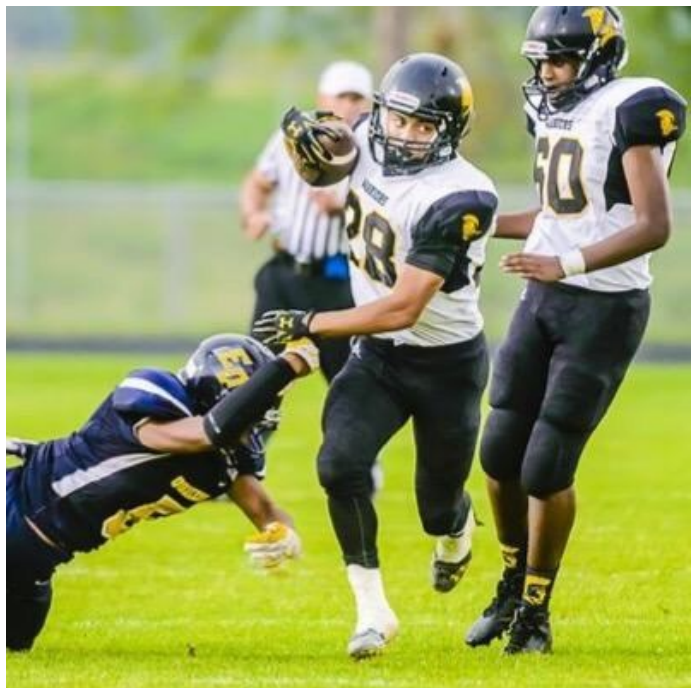
Waverly Warrior Football