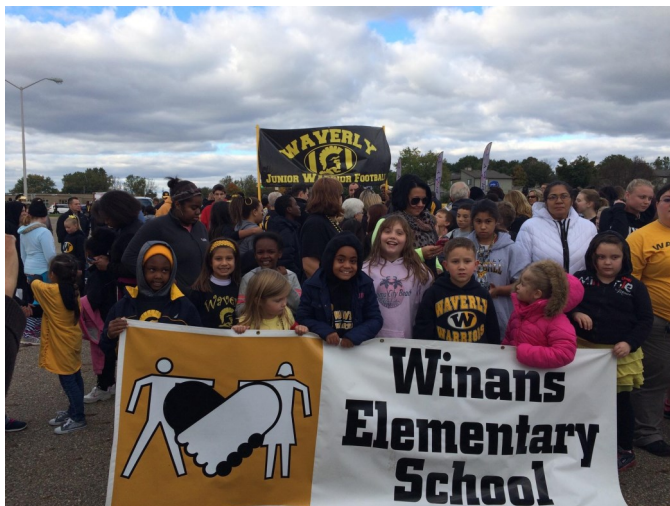
Waverly Homecoming Parade