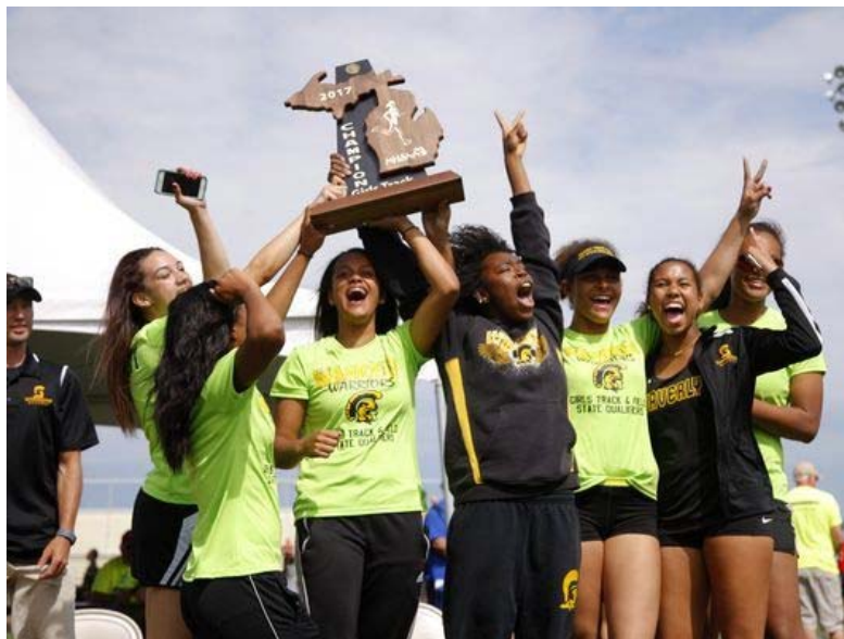
Waverly Girls Track—MHSAA Division 2 Champions—2 years in a row!