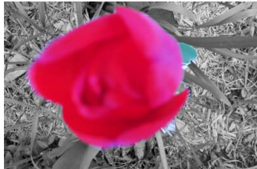
By: Xavyah Haynes