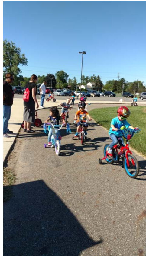
Colt ECEC—Preschool Bike Day