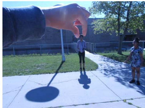
By: Faith Nwagbara